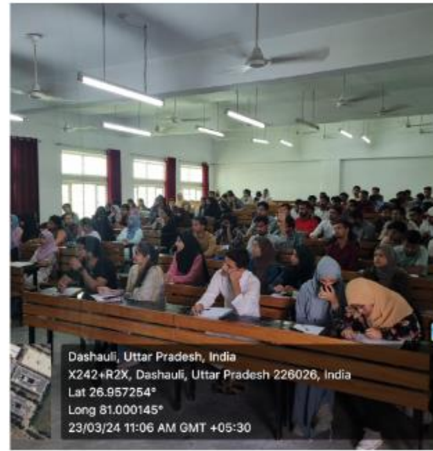
Dashauli, Uttar Pradesh, India X242+R2X, Dashauli, Uttar Pradesh 226026, India Lat 26.957254° Long 81.000145° 23/03/24 11:06 AM GMT +05:30