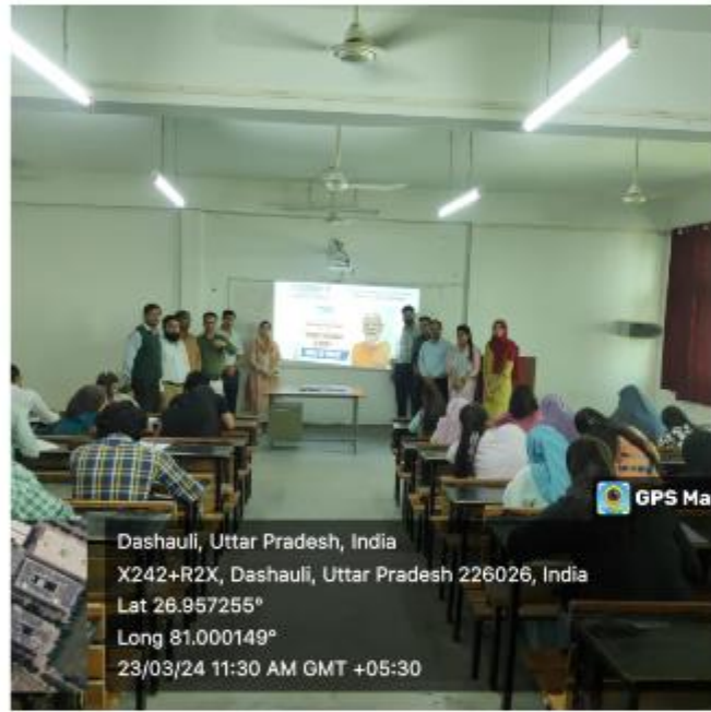
Dashauli, Uttar Pradesh, India X242+R2X, Dashauli, Uttar Pradesh 226026, India Lat 26.957255° Long 81.000149° 23/03/24 11:30 AM GMT +05:30