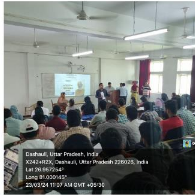
Dashauli, Uttar Pradesh, India X242+R2X, Dashauli, Uttar Pradesh 226026, India Lat 26.957254° Long 81.000145° 23/03/24 11:07 AM GMT +05:30