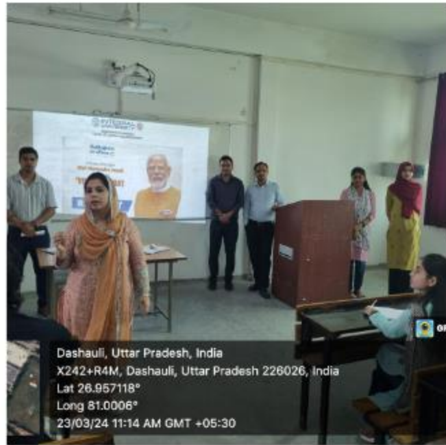
Dashauli, Uttar Pradesh, India X242+R4M, Dashauli, Uttar Pradesh 226026, India Lat 26.957118° Long 81.0006° 23/03/24 11:14 AM GMT +05:30